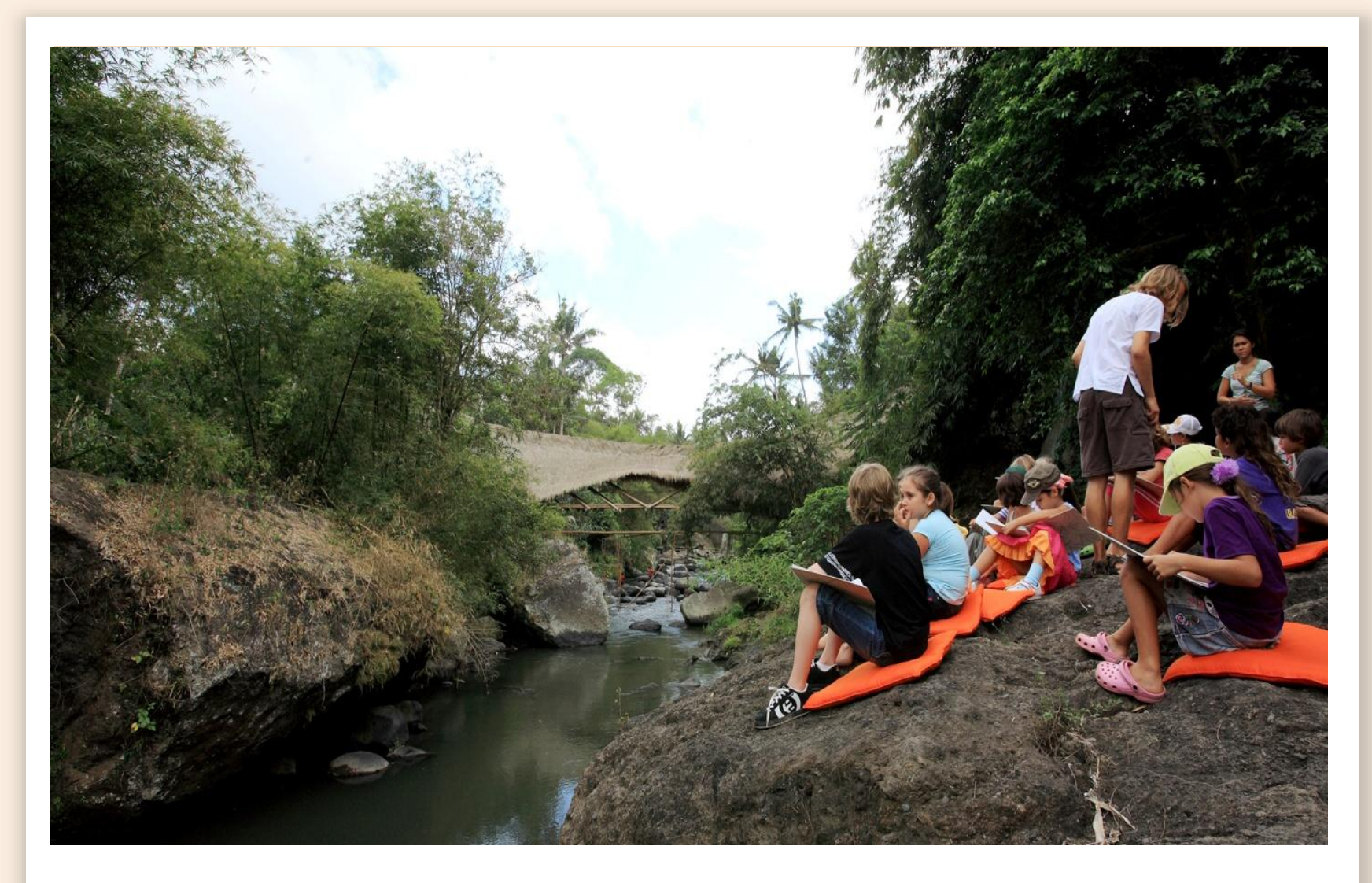
Reconnecting young people with nature