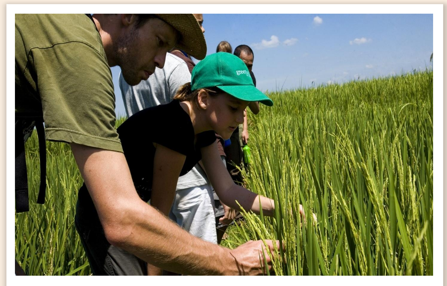
Green School is just one model...