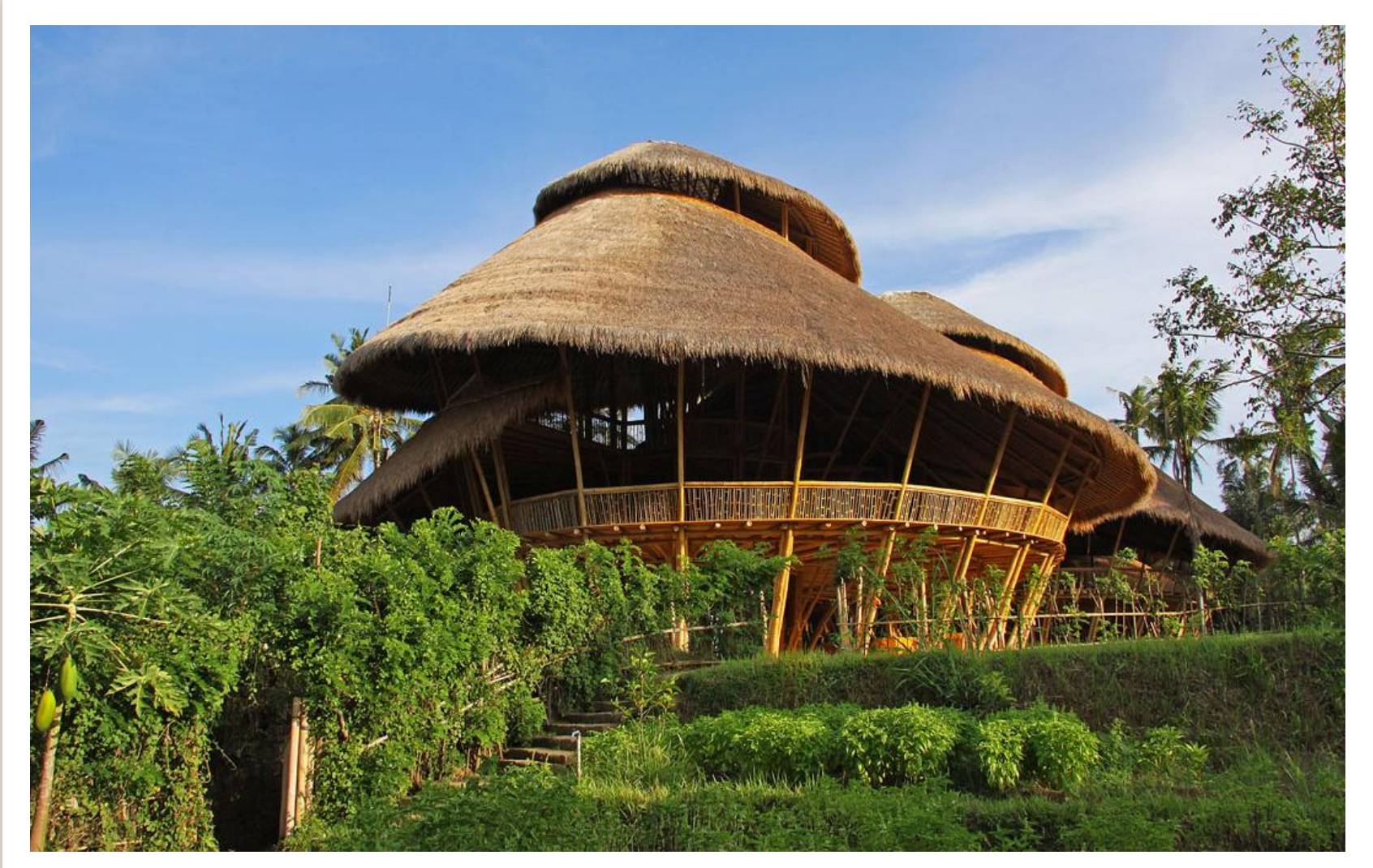
A model which is at the cutting edge of doing things differently: Green School