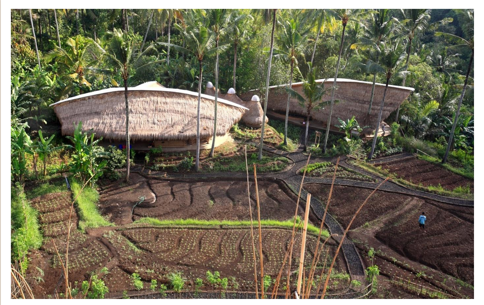
A pioneering project in sustainability in education — stunning architectural beauty using local natural materials.