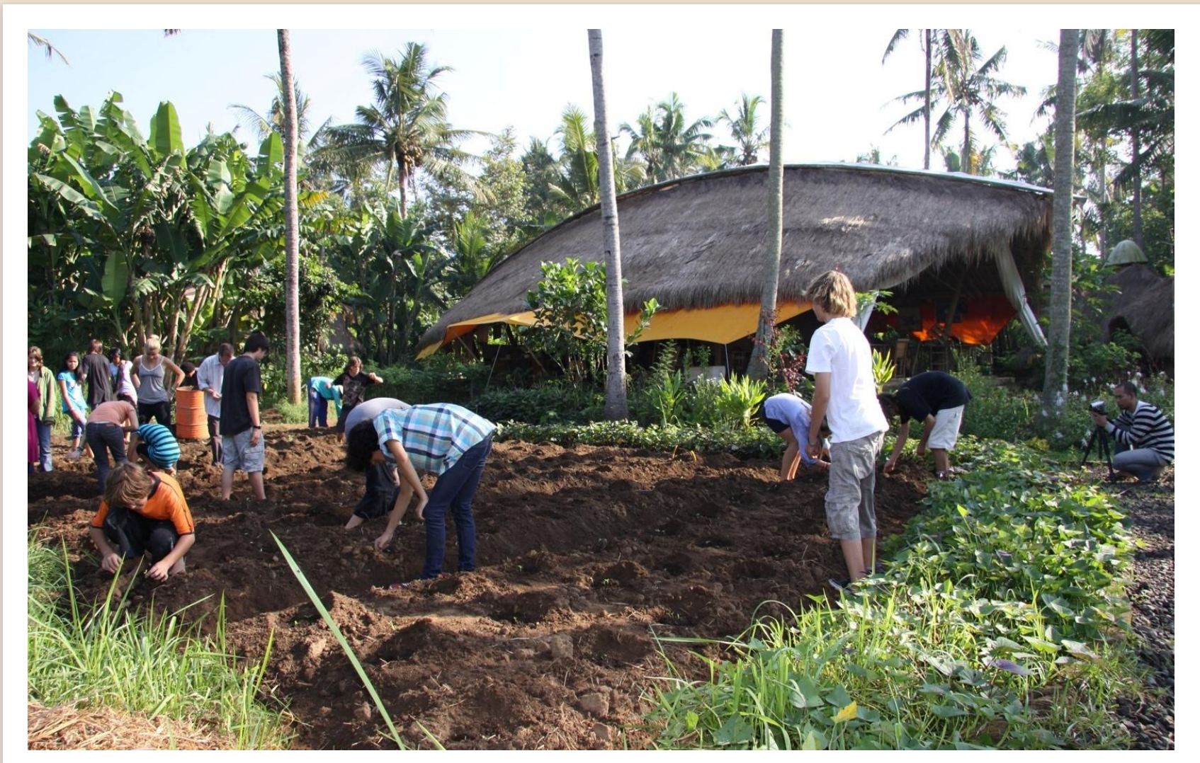
Learning about sustainability through the development of habits for life.